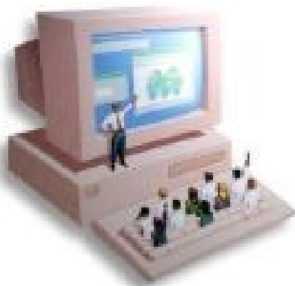
Figure2.Name of the figure

Lettering and symbols should be clearly defined either in the caption or in a legend provided as part of the figure. Figures should be placed at the top or bottom of a column wherever possible, and as close as possible to the first reference to them in the paper. Leave one line space between the heading and the figure.